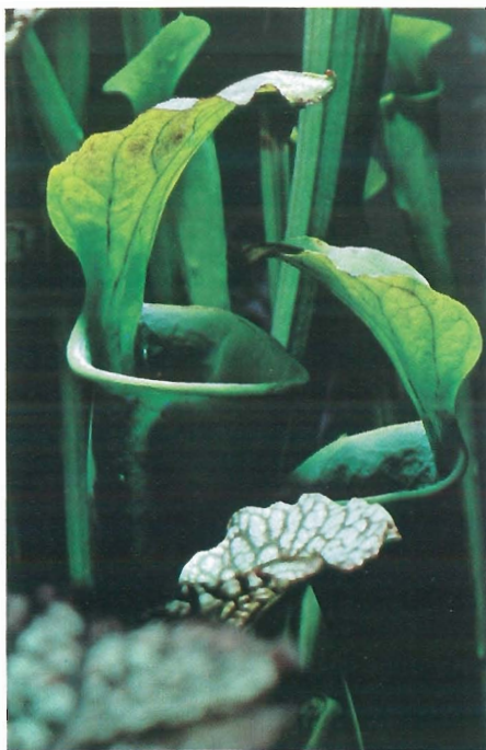
S. oreophila under metal halide at thirty inches from light source.