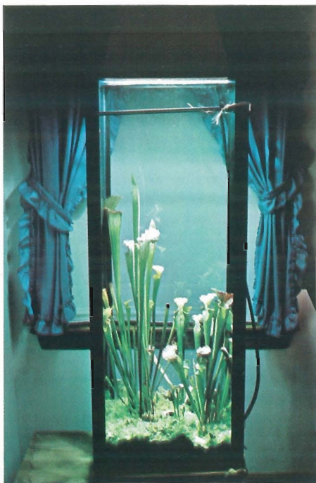
Fifty-gallon aquarium with one hundred seventy-five watt metal halide lamp.