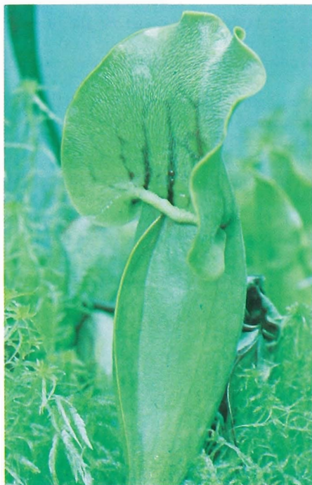
S. purpurea purpurea under mercury arc at twenty inches from light source.