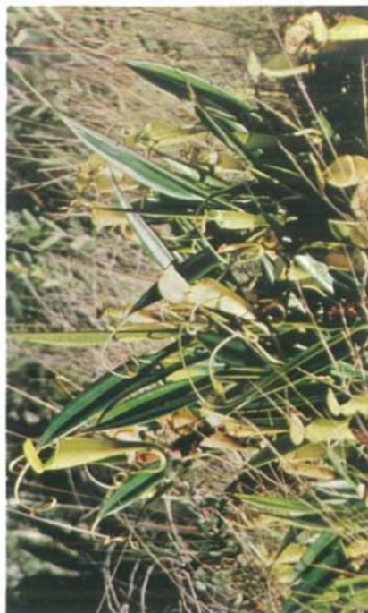
Another clump of N. madagascariensis .