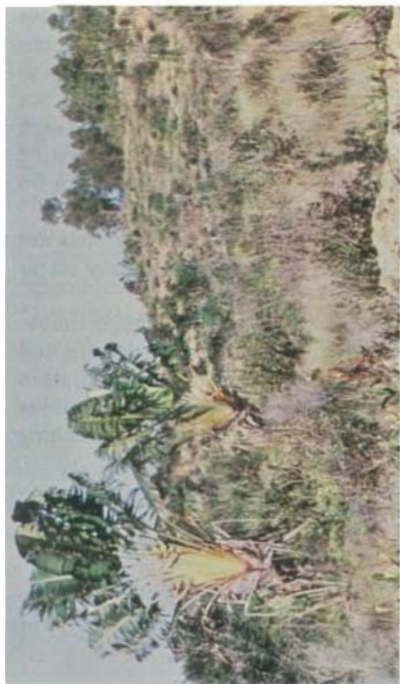
Eroded hillsides in Madagascar with Ravensia and N. madagascariensis .