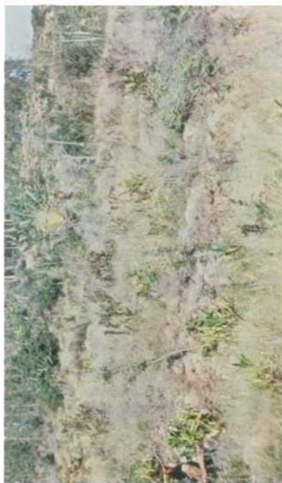
General habitat view.