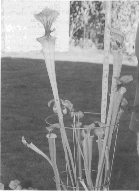
Figure 1: My 112 cm (44 inch) tall Sarracenia flava .

August 1996 was an important benchmark in my ongoing experiment. Three years have passed since my creation of an outdoor carnivorous plant bog and pond. It has withstood the worst weather that this state has to throw at us. All of the plants are doing well, especially the Darlingtonia (no surprise here). The bog is peppered with a variety of Pinguicula , Drosera , Sarracenia , as well as venus flytraps. A recent discovery this September was a 15 cm high Drosophyllum hidden in the swamp grass: what a paradox! I have tried to grow them by the book and they died. I threw the old seed in the wet, rained-on bog and they grew! I guess the