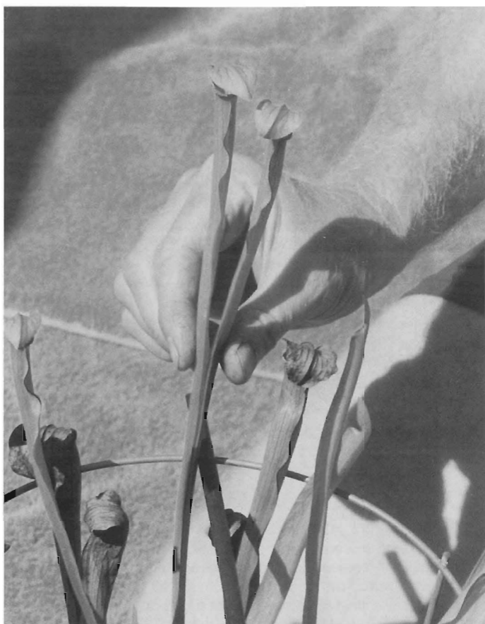
Figure 3: A double-pitched S. rubra oddity.