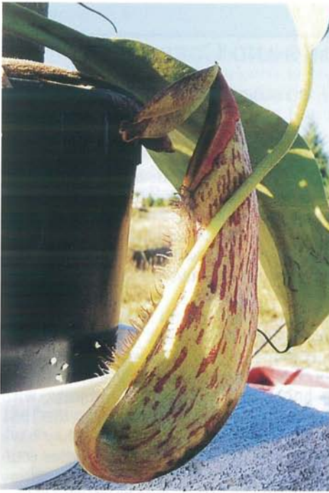
Figure 1: Nepenthes 'Bruce Bednar'.