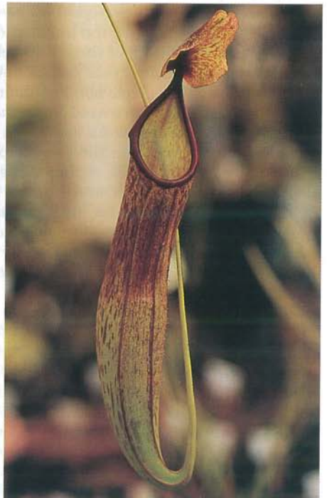
Figure 4: Nepenthes 'Nora', photo B. Meyers-Rice