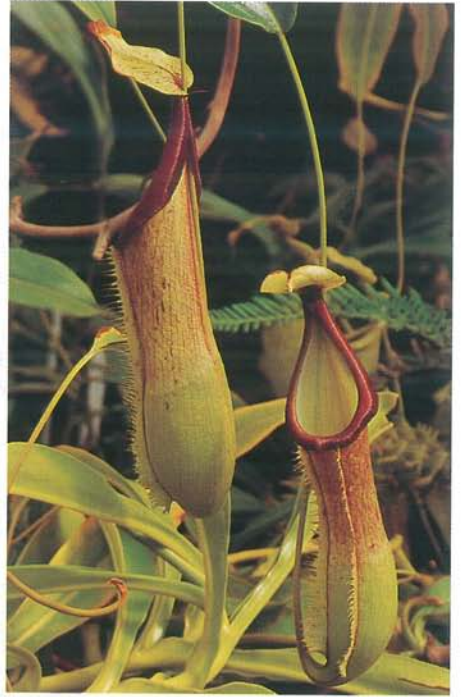
Figure 2: Nepenthes 'Frau Anna Babi', photo E.M. Salvia.