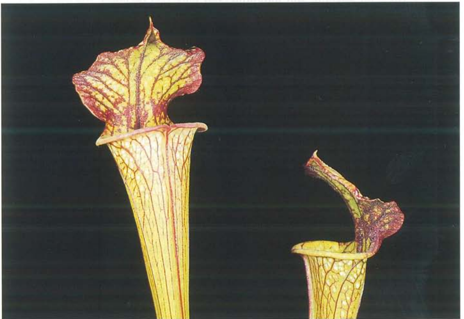
Figure 2: Sarracenia 'Lynda Butt', photograph by Barry Meyers-Rice