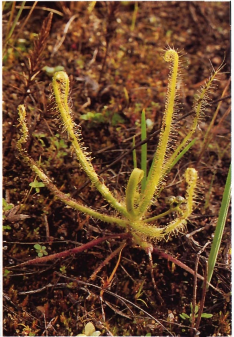
Figure 2: Typical Drosera indica from Narrabri.