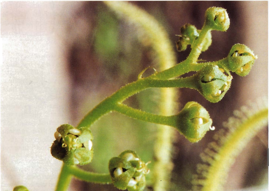
Figure 4: Functionally female flowers on Drosera indica .