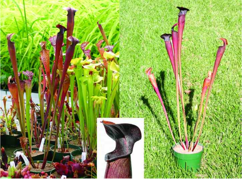
Figure 3: Sarracenia 'Night' The plant pictured was grown in a very bright greenhouse in Davis, CA.

The nomenclature of the red forms of S. alata is rather vague. Don Schnell (2002) mentions red S. alata plants, but he does not establish a name for them at the variety or form rank. Peter D'Amato (1998) mentions plants, using the descriptor "nigrapurpurea," to indicate specimens that have dark red or nearly black pitcher lid undersides. This term should be avoided since it has never been formally described, but the characteristics of S. alata 'Night' would appear to be similar, if not identical.