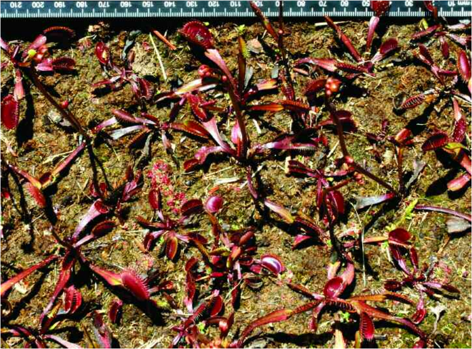
Figure 1: Dionaea muscipula 'Petite Dragon' growing outdoors in an artificial bog—spring rosettes are 6 cm in diameter.