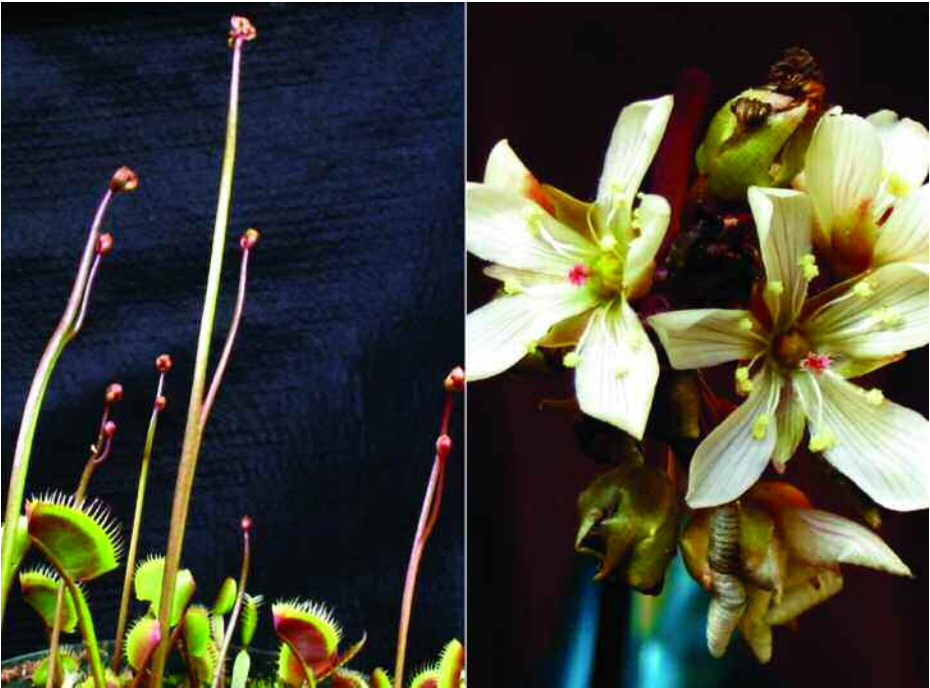
Figure 2: Dionaea muscipula 'Petite Dragon': bifurcated flower scapes in spring before greenhouse-grown plants have attained full red coloration (left), and flowers with red stigmas (right)