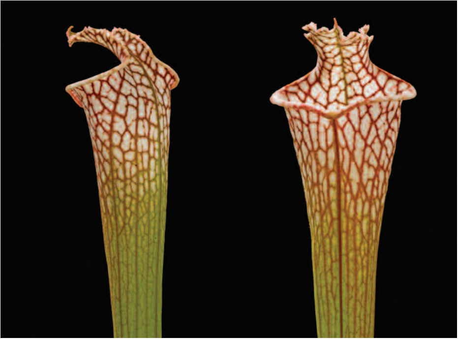
Figure 1: Sarracenia leucophylla 'Bris.'