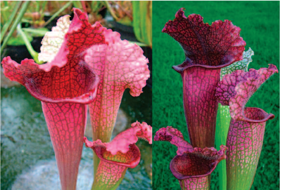
Figure 2: Sarracenia 'Juthatip Soper.'