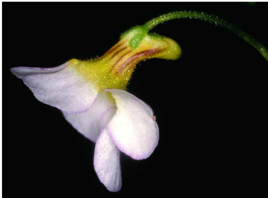
Figure 2: Profile view of Pinguicula lithophytica flower.