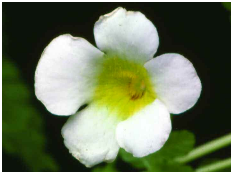
Figure 3: Front view of Pinguicula lithophytica flower.