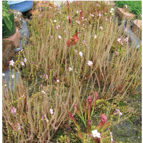
Figure 7: Drosera x californica 'Portland Sunrise' taking over a backyard bog near Portland, Oregon.