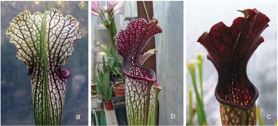
Figure 3: Sarracenia 'Black Mamba' early pitcher (a, b) and late pitcher (c).

Sarracenia 'Black Mamba' has a rhizome colored with anthocyanins. The pitcher is erect without folds as it develops. Early pitchers are initially green and light red (Fig. 3a). The growing pitcher begins to form many fenestrations from a few centimeters below the lip to the neck. Two red spots, well separated from fenestration, can be seen on the sides of the neck within the pitcher opening above the operculum. Abundant dark red veins extend to the middle of the pitcher (Fig. 3b).