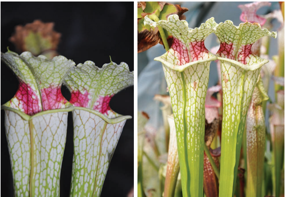
Figure 1: Sarracenia × moorei ‘Silvia Luise’ pitchers.

—DANIELE RIGHETTI • via Cavezzali 10/B • 20127 Milano • Italy • flava-rugelii@hotmail.it