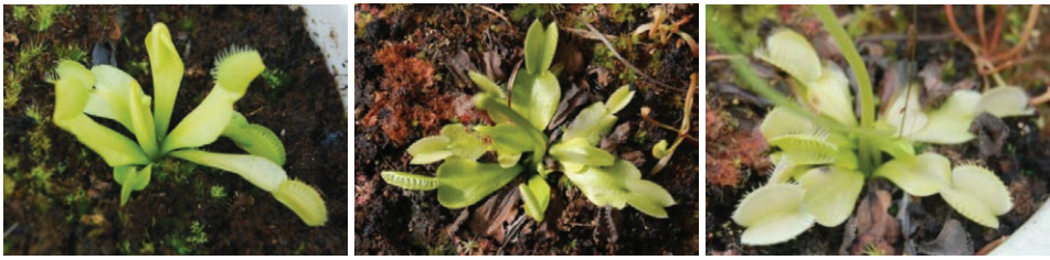
Figure 4: Dionaea muscipula 'Phoolan Devi' in early spring, middle spring, and summer (left to right).

raped Phoolan. After escaping from their captivity, she raised a Mallah-dominated gang, which carried out a series of violent robberies. She gained a fearsome reputation as the “Bandit Queen”, and some villagers started calling her an incarnation of the Hindu goddess Durga. Some people saw her violence as the lower castes’ retaliation against the cruelty of the upper-castes. In 1983, she surrendered and was sent to prison for 11 years. After her release, she contested elections as a candidate of the Samajwadi Party, and was elected to parliament in 1996. On July 25, 2001, she was shot dead outside her home by masked men from upper-caste.