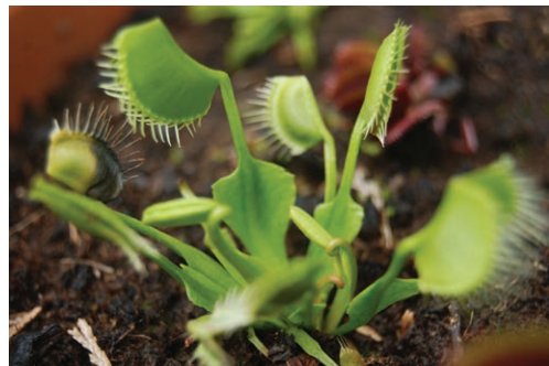
Figure 5: Dionaea muscipula ‘Kayan’.

Dionaea muscipula ‘Kayan’ is a Venus Flytrap with a very long neck that can reach 2.5 cm between the leaf and the trap (Fig. 5). The neck (petiole) may be similar in Dionaea ‘Crested Petioles’, but in this cultivar the neck is not always as elongated as in D. ‘Kayan’. Another plant with a long neck is Dionaea ‘Trichterfalle’, also known as ‘Funnel Trap’, but this cultivar has cupped traps.