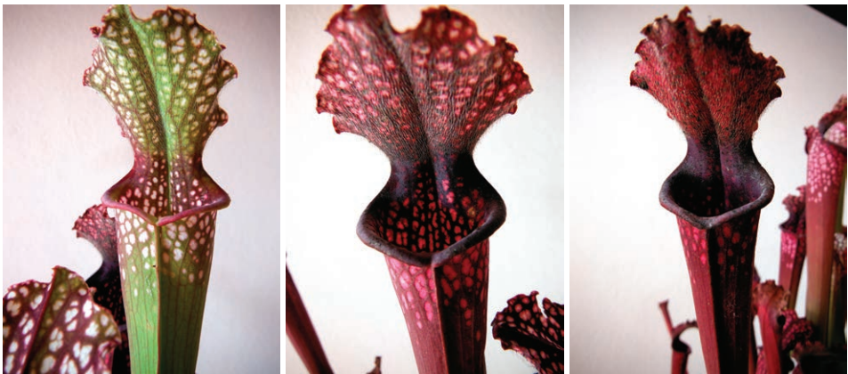
Figure 2: Sarracenia ‘Black Jaw’ early, middle, and late pitchers (left to right).

Cultivation is the same as with other Sarracenia . This hybrid is winter-hardy; it has survived -5°C without damage. Vegetative propagation is necessary to maintain the unique features.