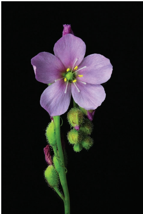
Figure 8: Flower of Drosera × californica ‘Portland Sunrise’.

The name Drosera ‘Portland Sunrise’ does not conflict with the hybrids Drosera ‘Ambrosia’ and ‘Dreamsicle’ described by Barnes (2011) because the aspect of the plants are different and we believe the D. filiformis parent had to be from a northern population of the species. The red Florida D. filiformis taxon will not survive outside over winter here. We use the hybrid name Drosera × californica because we accept that D. filiformis and D. tracyi are separate species (Cheek 1993; Rice 2011) in spite of some authors arguing that the species description of D. tracyi is inadequate (Schnell 1995). Use of the hybrid name is optional. The name applies to any plants that meet the description irrespective of method propagated. Some plants from seed will not agree with the description.