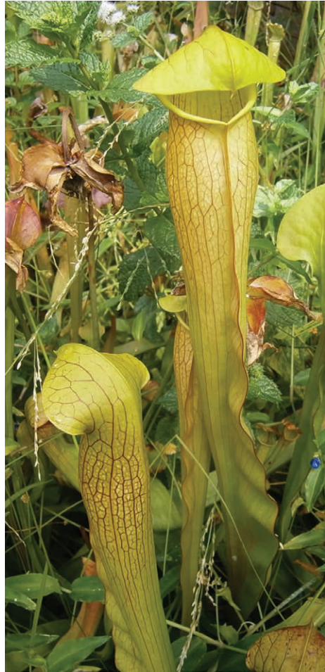
Figure 1: Sarracenia 'Yellow Eel'.

—STEVE AMOROSO • Australia • steve.1600@yahoo.com