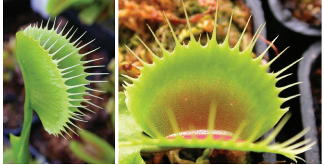
Figure 2: Dionaea 'Sonic' trap with long thin teeth (left) and with alternating long and short teeth (right).

Dionaea 'Sonic' must be reproduced vegetatively by rhizome or leaf cuttings to preserve the characteristics of the cultivar.