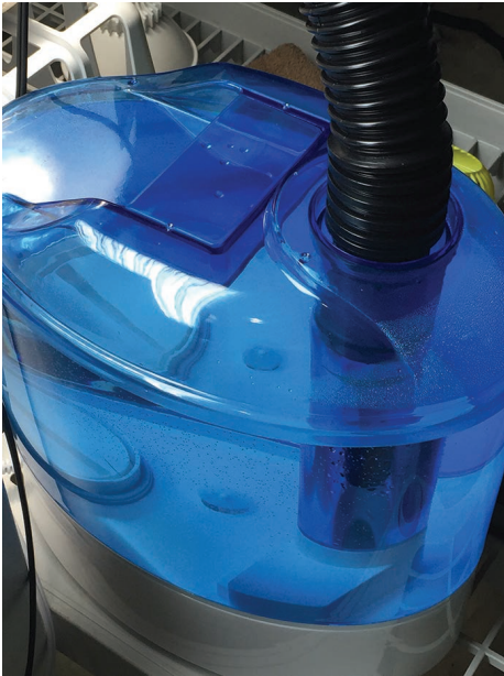
Figure 1: Ultrasonic humidifier with shop vac hose inserted into the output.