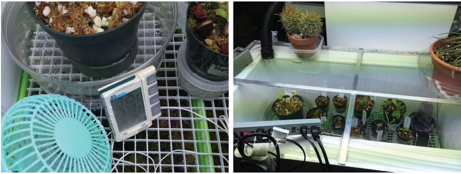
Figure 3: The completed chamber. A $4 USB fan circulates the air and prevents moisture accumulating on the foliage.

This was an interesting project and can easily be adapted to keep plants that are warm temperate species chilled, but not frozen, for dormancy, force orchids and bulbs into bloom, grow alpine species in warm areas, create warmer environments for desert plants, and even to augment husbandry of exotic reptile and amphibians. The downside to this project is that although my plants are slow growers, in 3-5 years I will either need a new set-up or several more freezers to accommodate their growth. By then, I hope to have a greenhouse with more cooling options available.