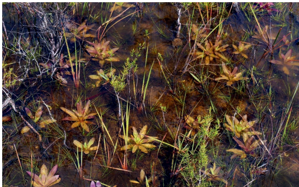
Figure 2: Pinguicula planifolia growing submerged in a pond.

that in pond sites, P. ionantha is more numerous in slightly deeper water, even if only by a matter of a cm or so. When rainfall comes to a sudden stop and sites begin to dry up, that tiny bit of extra depth can mean the difference between continued survival and certain death.