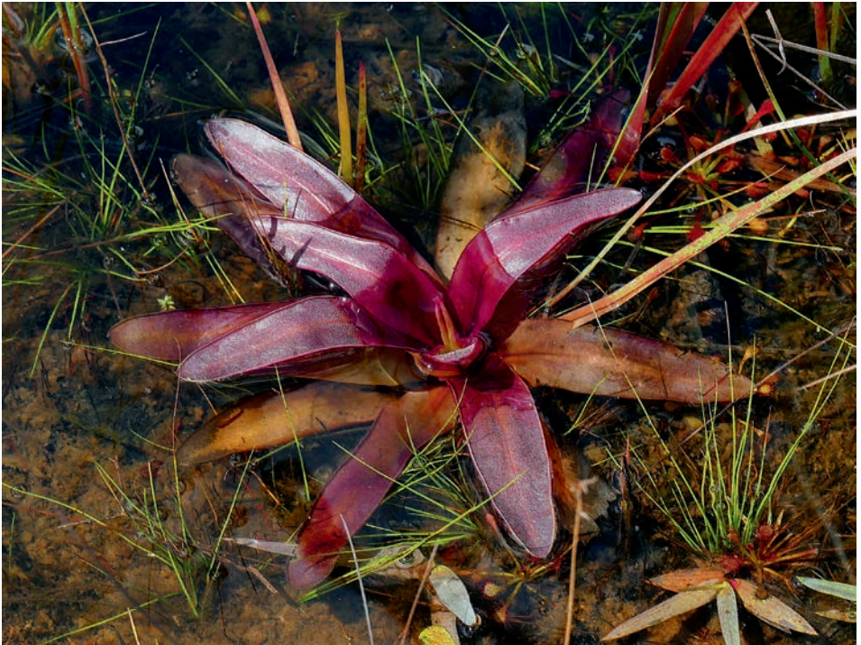
Figure 1: Pinguicula planifolia growing in a pond in the Apalachicola Forest.

Although Pinguicula ionantha also grows here, it is far less tolerant of our recent increase in drought conditions, often vanishing for an entire year or more, then reappearing again in impressive numbers following periods of above average rainfall. Because not all specimens of P. planifolia attain their characteristic deep red coloration, it can sometimes be difficult to differentiate between the two species when they are growing together unless they are in flower. Keen observers will note