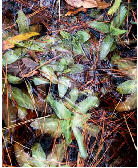
Figure 3: Pinguicula planifolia frozen in a block of ice.

I've always been in awe of the fact that this plant can grow in water that is surprisingly hot during the summer. To discover that it appears to be tolerant of both temperature extremes is a revelation. It makes me wonder what other secrets these amazing plants have yet to reveal to us.