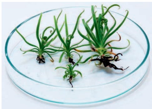
Several specimens displayed on a petri dish 132 days after first germination (diameter 15 cm).