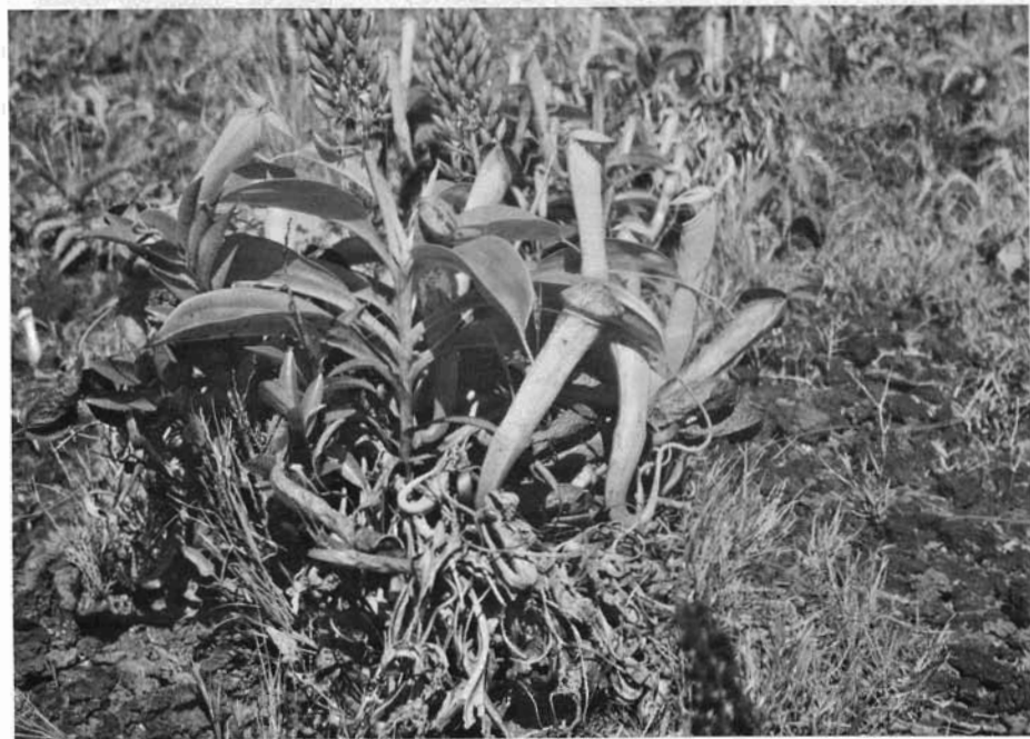
Close up of female N. mirabilis on Yap Island.

On Palau, N. mirabilis is called "Meliik"; on Yap, it is called "Youaad", or more commonly, "tafene fii ko borro", literally "the place that rats pee." It is thought that the pitchers contain rat urine, perhaps because of the odor of decaying insects. One of the local village employees of the Yap Institute of Natural Sciences who accompanied me in the field was surprised that there was water in the new, unopened pitchers, and wondered how it got