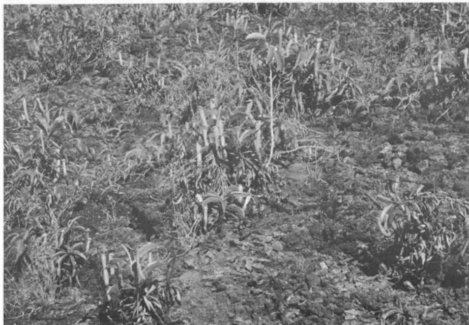
N. mirabilis on Yap Island, December, 1987.

The variety of species encountered in the Pacific islands declines as you move from the Asian mainland. Hawaii, for example, has only 1/2 to 1/3 as many species as is found in Palau. Fosberg, et al. (1979) listed the presence of Nepenthes mirabilis in the Palau group on Babeldaop, Koror, Ngarakabesang, Malakal, Aulupse'el, Urukthapel, and Orokuiza; and in the Yap group on Yap. Drosera burmannii and D. spathulata were found only on Babeldaop. Utricularia bifida was reported on Babeldaop and Koror, Yap, and Guam; U. caerulea on Babeldaop and Guam; U. racemosa on Koror; and U. ulginosa on Babeldaop. Stemmermann and Proby (1978) have published detailed location maps of their vegetation sites. Their paper also contains photographs of U. bifida and U. nivea on Palau, and N. mirabilis on Yap. It would be interesting if someone were to take a detailed look at the