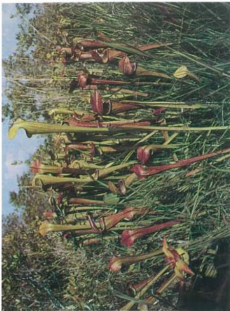
Figure 3. Heavily pigmented forms of S. alata in Leon County, Texas. June 7, 1988.