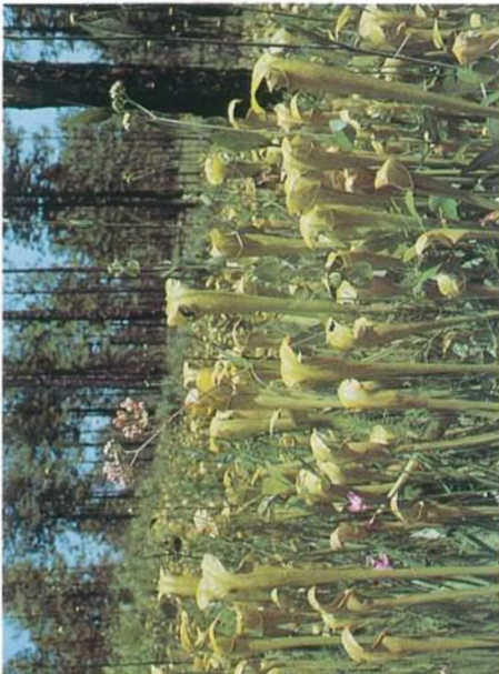
Figure 5. Golden yellow S. alata in hillside seepage bog of Newton County, Texas. Note Asclepias rubra L., Calopogon tuberosus (L) Bsp., Rudbeckia scabrifolia L.E. Brown and Eupatorium rotundifolium L. in flower. June 10, 1988.