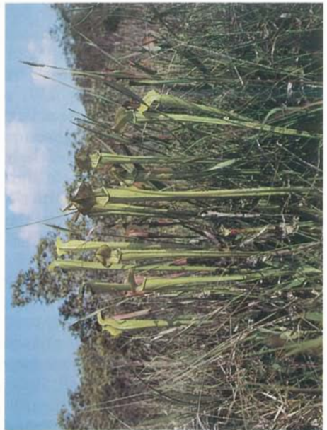
Figure 4. Typical form of S. alata in the western part of its range. June 7, 1988.