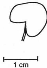
Leaf of U. nephrophylla of the Roraima form