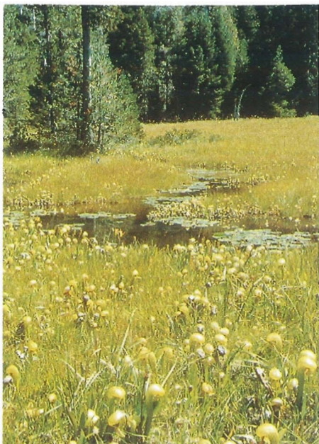
Figure 3 - Open pools and clear, slow flowing streams of Snow Camp Meadow. Note very gentle slope to site and stoloniferous invasion of pools by D. californica .