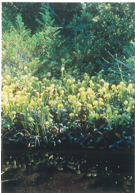
Figure 1 - Hunter Creek Bog - notice crystal clear water and abundant D. californica growth.