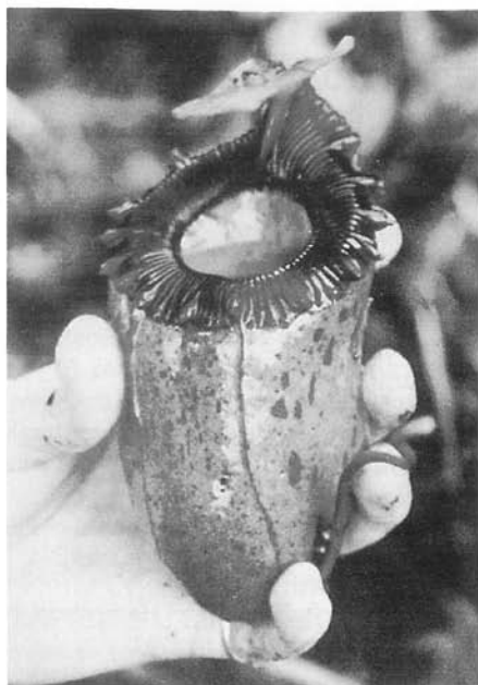
Figure 2: Nepenthes sibuyanensis