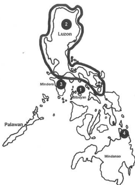
Figure 3: Distribution of Nepenthes sibuyanensis , Nepenthes merrilliana , Nepenthes ventricosa and Nepenthes burkei at the Philippines.