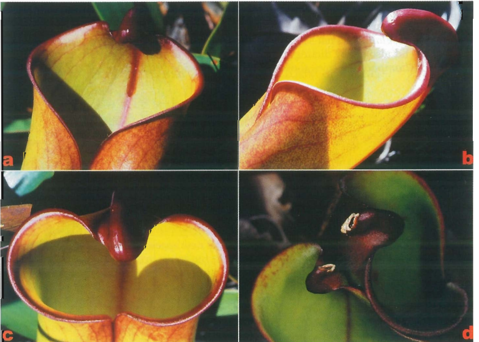
Figure 4: Details of H. folliculata pitchers. A) nectar (dark red) running down from the lid, B) lid showing the hollow hunchback-like structure, C) pitcher compressed front to back, leading to kidney shaped mouth, D) nectar reservoirs opened by insects.