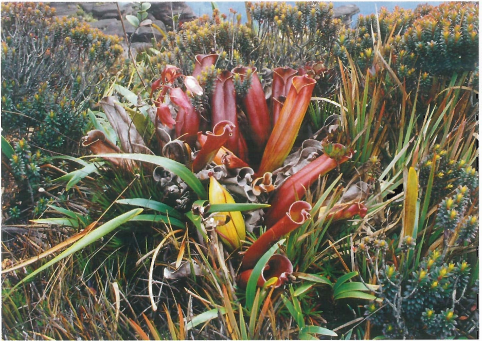
Figure 3: A group of H. folliculata pitchers on Aparaman Tepui.