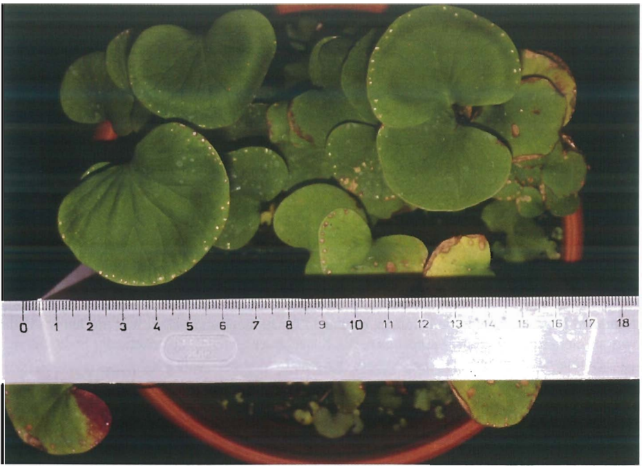
Figure 1: Large aerial leaf blades of Utricularia reniformis Enfant Terrible , grown at the Botanic Gardens Liberec.