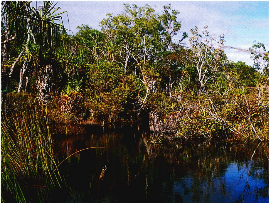
Figure 3: Nepenthes mirabilis habitat in Cape York, Queensland; N. mirabilis visible at the right. Nepenthes rowanae habitat is similar.