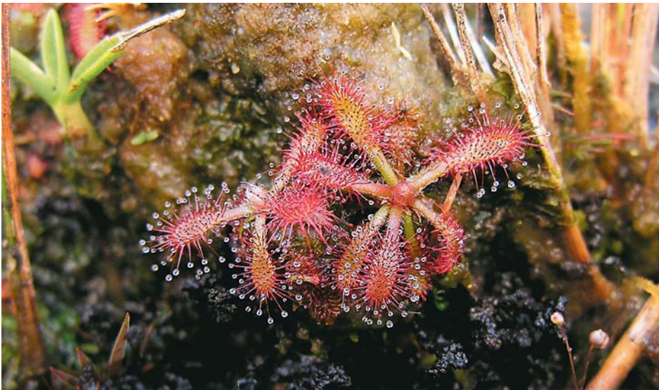
Figure 3: Drosera × fontinalis Rivadavia at the Chapada dos Veadeiros.