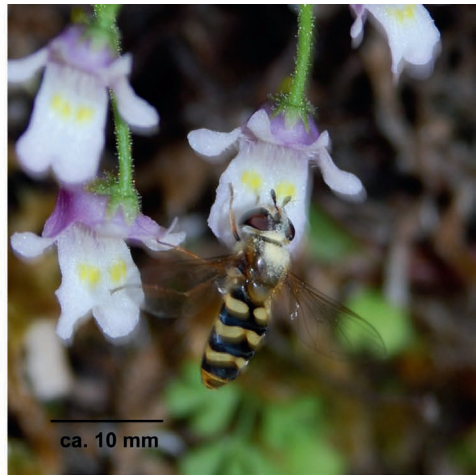
Figure 1: Unidentified sweat bee species on P. macroceras flower at Nakatsu-kyo Gorge (left); Hoverfly on P. ramosa flower at Mt. Koshin-zan (right).