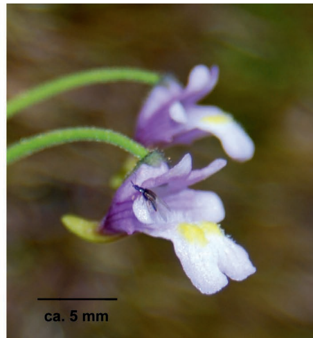
Figure 2: Mating ocellate rove beetles on P. ramosa flower at Mt. Nantai-san (left); ocellate rove beetle expanding wings on P. ramosa flower at Mt. Nantai-san (right).

are probably active only under specific conditions, e.g. weather, temperature, and the time of day, during a relatively short Pinguicula flowering season. The observed possible pollinators are seldom caught as prey by the plants (pers. obs., H. Shimai). It is possible that other insect species visit their flowers as reported by Shimai (2016). The localities of Pinguicula in Japan are mostly restricted to higher mountains or deep gorges (Komiya & Shibata 1999) normally difficult to access for periodical observations. Further studies are, however, required concerning the pollinators for Pinguicula as the entomological fauna changed at the locality, the author thinks that the Pinguicula population might possibly decline.