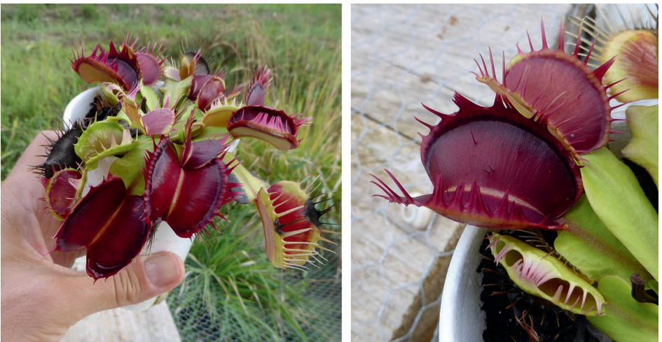
Figure 2: Dionaea 'Cleopatra' plant and traps.

—ANDREA AMICI • via dei Ciclamini, 47 • 40043, Marzabotto • Bologna • Italia • cephalotus@libero.it • http://www.phylla.com/ilpigliamosche