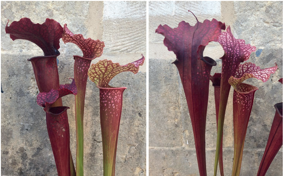
Figure 1: Sarracenia 'Max Rawlings' young, intermediate, and old pitchers (right to left).