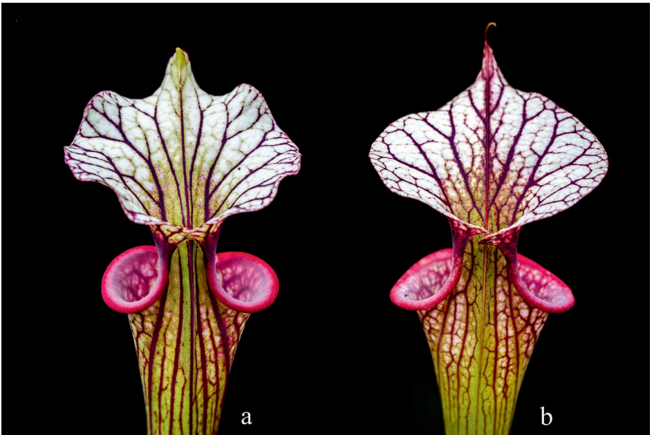
Figure 4: Comparison of venation pattern and lid shape of a) Sarracenia 'Inspiration' and b) Sarracenia 'Adrian Slack'.

Sarracenia 'Inspiration' does not require any specific growth conditions compared to other Sarracenia . Very sunny and hot conditions are required to obtain optimal coloration. To keep its original genotype, propagation must be by vegetative means only. Sarracenia 'Inspiration' is unfortunately not a very strong growing plant. Despite this, it is already well spread across European collections under its hybrid label or code mentioned above. A few specimens are also in circulation among U.S. growers.