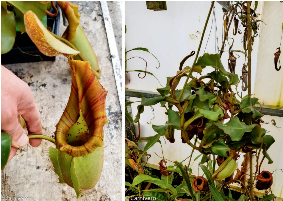
Figure 1: Nepenthes veitchii 'Jim Bockowski' pitcher and plant after 3 m of vine was removed.

—DREW MARTINEZ • Carnivero • Austin • Texas • USA • info@carnivero.com